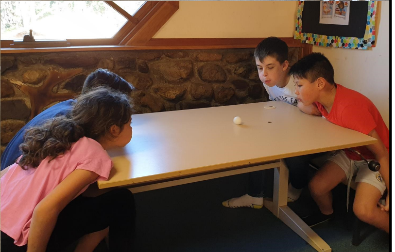
The Senior Class are exploring FORCES as part of their Term 3 Science studies. Last week we investigated how forces are used in games and play, and this week we examined the concept of momentum.