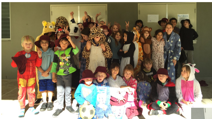
PJ / Onesies Day Last Day of Term 2